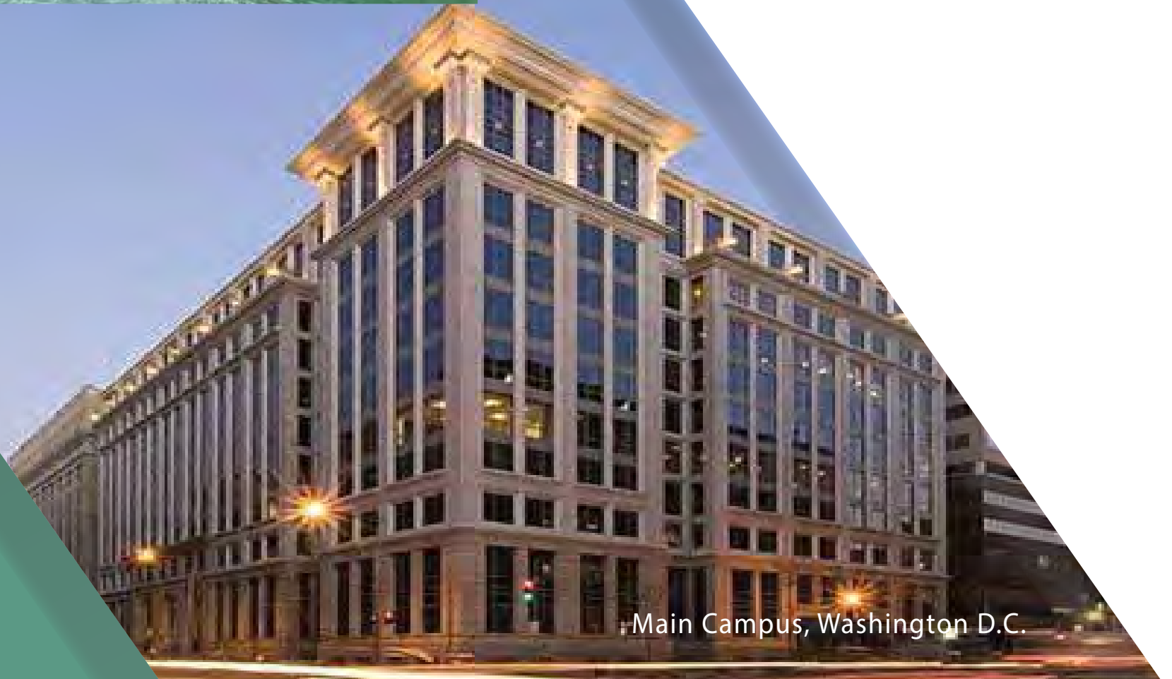
Main Campus, Washington D.C.